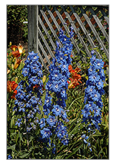
Cobalt Dreams Larkspur flowers