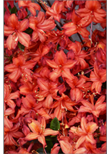
Electric Lights Red Azalea flowers