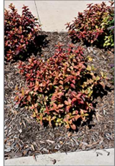
Midnight Sun Reblooming Weigela