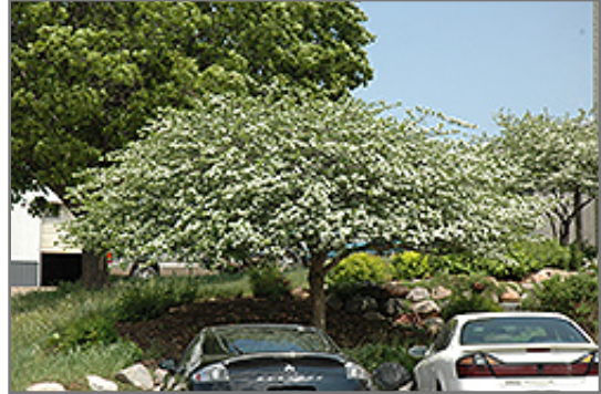
Thornless Cockspur Hawthorn in bloom