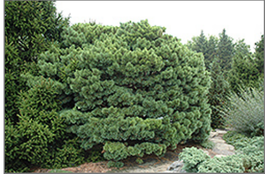
Dwarf Blue Scotch Pine