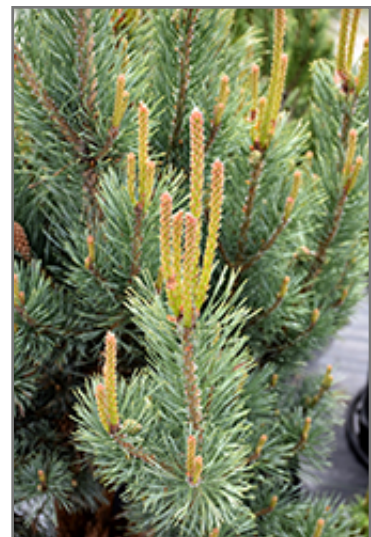
Dwarf Blue Scotch Pine foliage