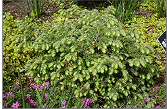
Moon Frost Hemlock

Moon Frost Hemlock is recommended for the following landscape applications;