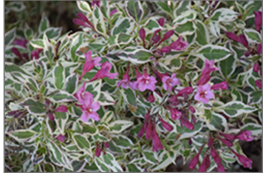
My Monet Weigela flowers