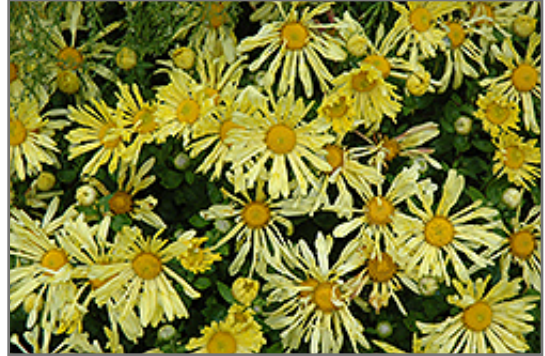
Yellow Quill Chrysanthemum flowers