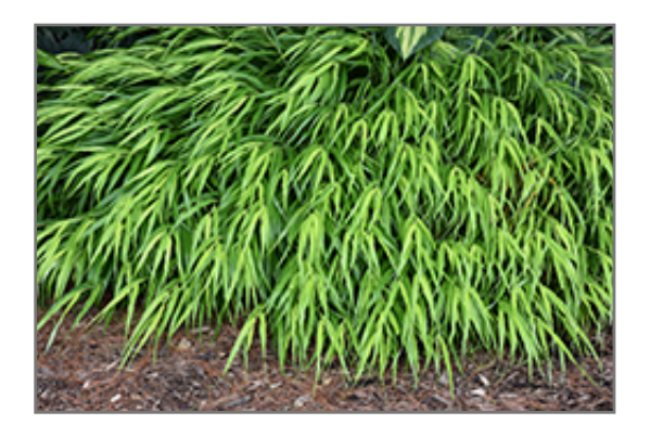
All Gold Hakone Grass foliage