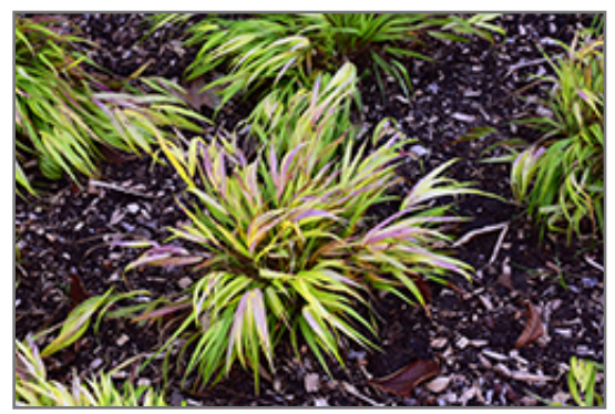
All Gold Hakone Grass in fall

All Gold Hakone Grass is a fine choice for the garden, but it is also a good selection for planting in outdoor pots and containers. It is often used as a 'filler' in the 'spiller-thriller-filler' container combination, providing a canvas of foliage against which the thriller plants stand out. Note that when growing plants in outdoor containers and baskets, they may require more frequent waterings than they would in the yard or garden. Be aware that in our climate, most plants cannot be expected to survive the winter if left in containers outdoors, and this plant is no exception. Contact our experts for more information on how to protect it over the winter months.