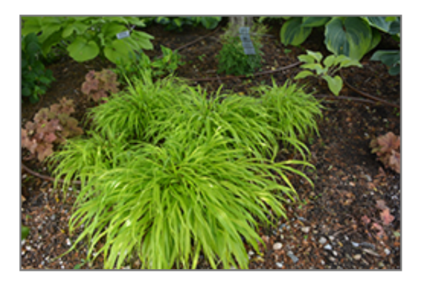
All Gold Hakone Grass

P.O. Box 249, 2350 West Wayzata Blvd., Long Lake, MN 55356 www.ottenbros.com | 952-473-5425 | fax 952-473-7232