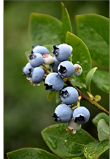
Northblue Blueberry fruit