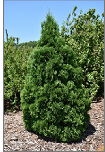
Holmstrup Arborvitae flowers

Holmstrup Arborvitae will grow to be about 8 feet tall at maturity, with a spread of 4 feet. It tends to fill out right to the ground and therefore doesn't necessarily require facer plants in front, and is suitable for planting under power lines. It grows at a slow rate, and under ideal conditions can be expected to live for approximately 30 years.