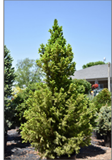
Big Berta White Spruce