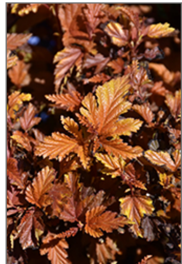
Angel Ninebark foliage