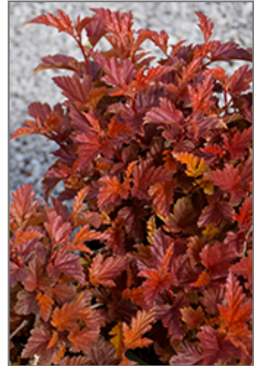
Angel Ninebark foliage