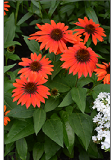
Sombrero Flamenco Orange Coneflower in bloom

Sombrero Flamenco Orange Coneflower is recommended for the following landscape applications;