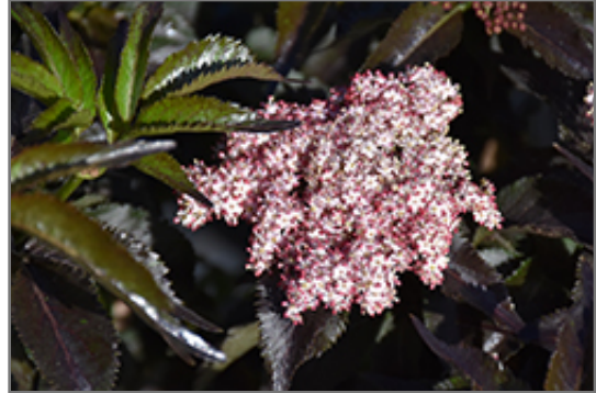
Black Tower Elder flowers

Black Tower Elder will grow to be about 8 feet tall at maturity, with a spread of 4 feet. It has a low canopy with a typical clearance of 1 foot from the ground, and is suitable for planting under power lines. It grows at a fast rate, and under ideal conditions can be expected to live for approximately 30 years.