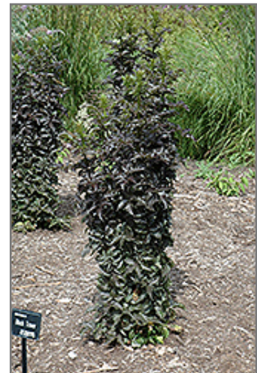
Black Tower Elder