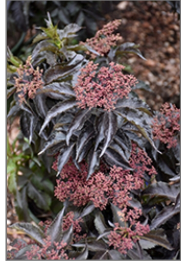
Black Tower Elder flower buds

Black Tower Elder is recommended for the following landscape applications;