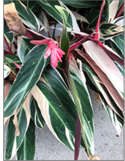
Tricolor Stromanthe flowers

This plant does best in full sun to partial shade. It prefers to grow in average to moist conditions, and shouldn't be allowed to dry out. It is not particular as to soil pH, but grows best in rich soils. It is somewhat tolerant of urban pollution. This is a selected variety of a species not originally from North America. It can be propagated by division; however, as a cultivated variety, be aware that it may be subject to certain restrictions or prohibitions on propagation.