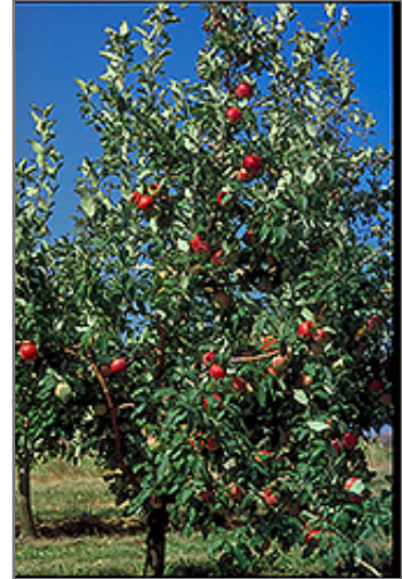
Zestar Apple fruit

This tree is typically grown in a designated area of the yard because of its mature size and spread. It should only be grown in full sunlight. It prefers to grow in average to moist conditions, and shouldn't be allowed to dry out. It is not particular as to soil type or pH. It is highly tolerant of urban pollution and will even thrive in inner city environments. This particular variety is an interspecific hybrid.