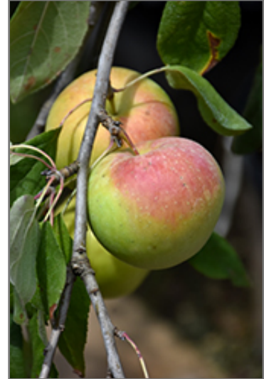
Zestar Apple fruit

Zestar Apple features showy clusters of lightly-scented white flowers with shell pink overtones along the branches in mid spring, which emerge from distinctive pink flower buds. It has forest green deciduous foliage. The pointy leaves turn yellow in fall. The fruits are showy red apples with hints of yellow, which are carried in abundance from late summer to early fall. The fruit can be messy if allowed to drop on the lawn or walkways, and may require occasional clean-up.