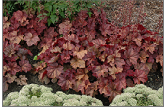
Lava Lamp Coral Bells

Lava Lamp Coral Bells will grow to be about 16 inches tall at maturity extending to 32 inches tall with the flowers, with a spread of 28 inches. When grown in masses or used as a bedding plant, individual plants should be spaced approximately 24 inches apart. Its foliage tends to remain dense right to the ground, not requiring facer plants in front. It grows at a medium rate, and under ideal conditions can be expected to live for approximately 10 years. As an evergreen perennial, this plant will typically keep its form and foliage year-round.