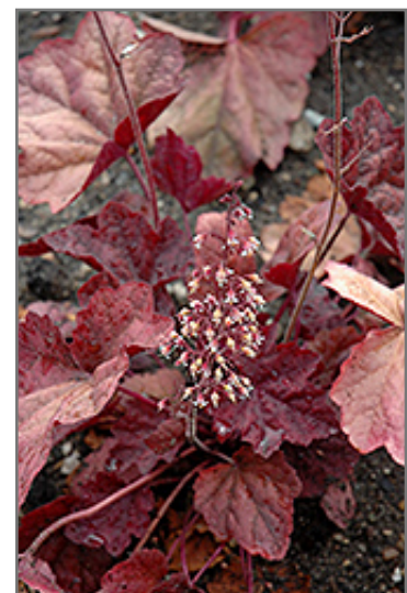
Lava Lamp Coral Bells flowers