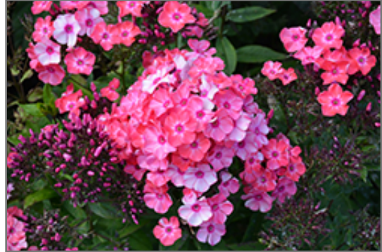
Garden Girls Glamour Girl Garden Phlox flowers