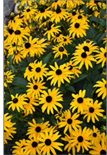
American Gold Rush Coneflower flowers

This is a relatively low maintenance plant, and should be cut back in late fall in preparation for winter. It is a good choice for attracting birds, bees and butterflies to your yard, but is not particularly attractive to deer who tend to leave it alone in favor of tastier treats. It has no significant negative characteristics.