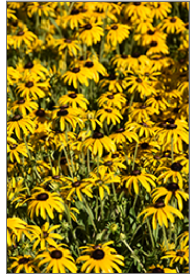
American Gold Rush Coneflower flowers

American Gold Rush Coneflower is a fine choice for the garden, but it is also a good selection for planting in outdoor pots and containers. With its upright habit of growth, it is best suited for use as a 'thriller' in the 'spiller-thriller-filler' container combination; plant it near the center of the pot, surrounded by smaller plants and those that spill over the edges. Note that when growing plants in outdoor containers and baskets, they may require more frequent waterings than they would in the yard or garden. Be aware that in our climate, most plants cannot be expected to survive the winter if left in containers outdoors, and this plant is no exception. Contact our experts for more information on how to protect it over the winter months.