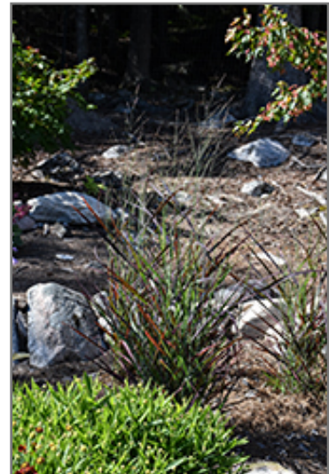
Hot Rod Switch Grass