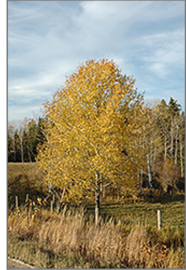
Trembling Aspen in fall

This tree should only be grown in full sunlight. It is an amazingly adaptable plant, tolerating both dry conditions and even some standing water. It is considered to be drought-tolerant, and thus makes an ideal choice for xeriscaping or the moisture-conserving landscape. It is not particular as to soil type or pH. It is quite intolerant of urban pollution, therefore inner city or urban streetside plantings are best avoided. This species is native to parts of North America.