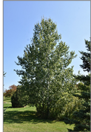
Trembling Aspen