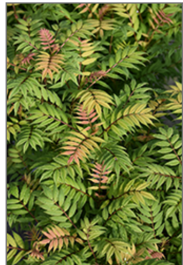
Mr. Mustard False Spirea foliage