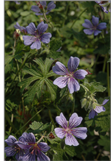
Brookside Cranesbill flowers

Brookside Cranesbill is recommended for the following landscape applications;