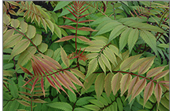
Sem False Spirea foliage