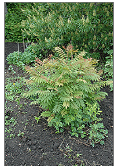
Sem False Spirea