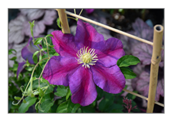
Sunset Clematis flowers