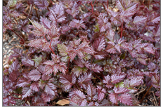
Delft Lace Astilbe foliage

Delft Lace Astilbe will grow to be about 16 inches tall at maturity extending to 24 inches tall with the flowers, with a spread of 12 inches. When grown in masses or used as a bedding plant, individual plants should be spaced approximately 12 inches apart. Its foliage tends to remain dense right to the ground, not requiring facer plants in front. It grows at a medium rate, and under ideal conditions can be expected to live for approximately 10 years. As an herbaceous perennial, this plant will usually die back to the crown each winter, and will regrow from the base each spring. Be careful not to disturb the crown in late winter when it may not be readily seen!