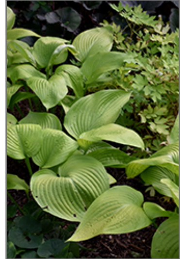
Key West Hosta

This plant does best in partial shade to shade. It prefers to grow in average to moist conditions, and shouldn't be allowed to dry out. It is not particular as to soil type or pH. It is somewhat tolerant of urban pollution. This particular variety is an interspecific hybrid. It can be propagated by division; however, as a cultivated variety, be aware that it may be subject to certain restrictions or prohibitions on propagation.