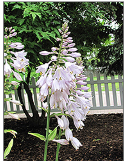
Key West Hosta flowers