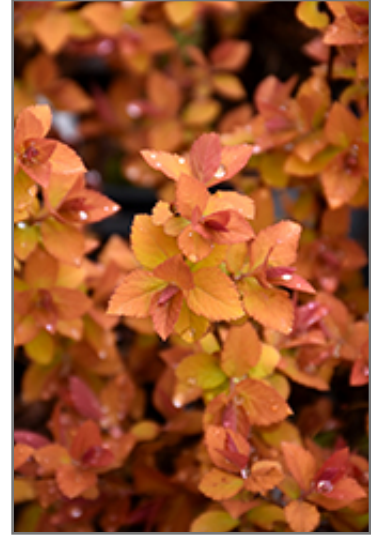
Double Play Big Bang Spirea foliage

This shrub should only be grown in full sunlight. It prefers to grow in average to moist conditions, and shouldn't be allowed to dry out. It is not particular as to soil type or pH. It is highly tolerant of urban pollution and will even thrive in inner city environments. This particular variety is an interspecific hybrid.