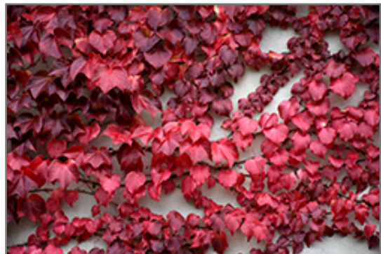
Veitch Boston Ivy in fall