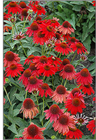
Sombbrero Salsa Red Coneflower flowers

Sombbrero Salsa Red Coneflower is recommended for the following landscape applications;