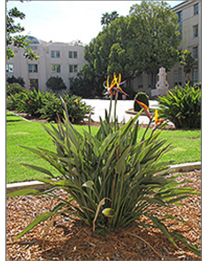
Orange Bird Of Paradise in bloom

Orange Bird Of Paradise is a fine choice for the garden, but it is also a good selection for planting in outdoor pots and containers. With its upright habit of growth, it is best suited for use as a 'thriller' in the 'spiller-thriller-filler' container combination; plant it near the center of the pot, surrounded by smaller plants and those that spill over the edges. It is even sizeable enough that it can be grown alone in a suitable container. Note that when growing plants in outdoor containers and baskets, they may require more frequent waterings than they would in the yard or garden. Be aware that in our climate, most plants cannot be expected to survive the winter if left in containers outdoors, and this plant is no exception. Contact our experts for more information on how to protect it over the winter months.