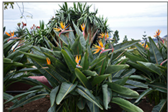
Orange Bird Of Paradise in bloom