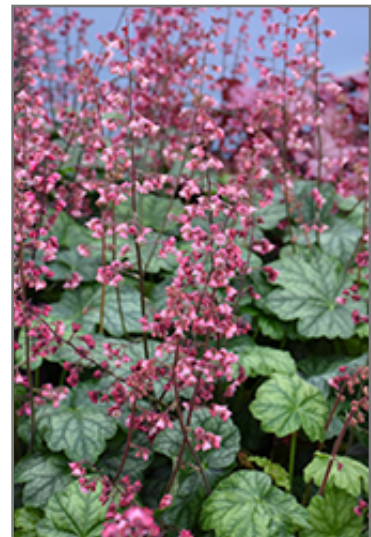
Berry Timeless Coral Bells flowers