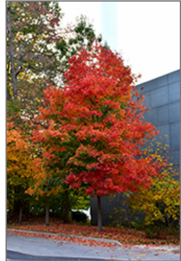
Fall Fiesta Sugar Maple in fall