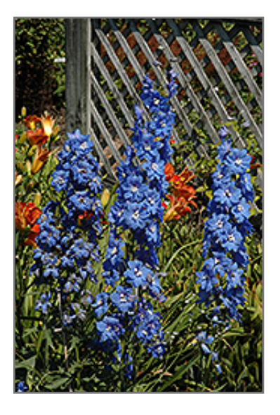
Cobalt Dreams Larkspur flowers

P.O. Box 249, 2350 West Wayzata Blvd., Long Lake, MN 55356 www.ottenbros.com | 952-473-5425 | fax 952-473-7232