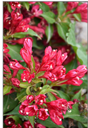
Crimson Kisses Weigela flowers