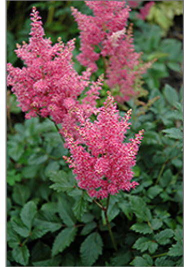
Rheinland Astilbe flowers