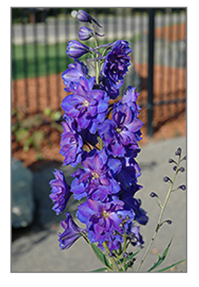
Pagan Purples Larkspur flowers

P.O. Box 249, 2350 West Wayzata Blvd., Long Lake, MN 55356 www.ottenbros.com | 952-473-5425 | fax 952-473-7232