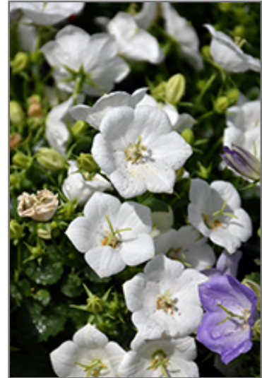
Rapido White Bellflower flowers