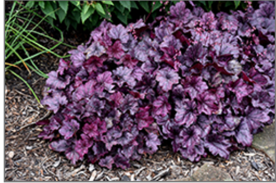
Wild Rose Coral Bells

This is a relatively low maintenance plant, and should be cut back in late fall in preparation for winter. It is a good choice for attracting hummingbirds to your yard. It has no significant negative characteristics.