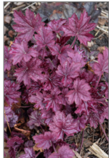
Wild Rose Coral Bells foliage