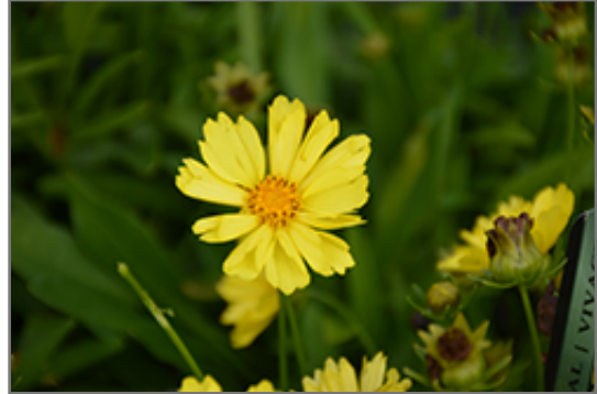
Leading Lady Sophia Tickseed flowers