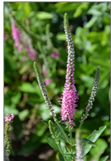
Perfectly Picasso Speedwell flowers