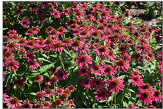
Sombrero Tres Amigos Coneflower in bloom