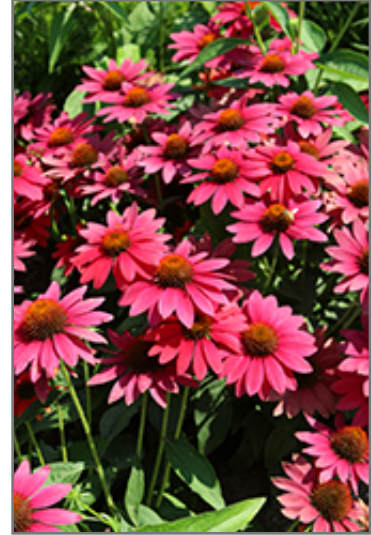
Sombrero Tres Amigos Coneflower flowers

This is a relatively low maintenance plant, and is best cleaned up in early spring before it resumes active growth for the season. It is a good choice for attracting butterflies to your yard, but is not particularly attractive to deer who tend to leave it alone in favor of tastier treats. It has no significant negative characteristics.