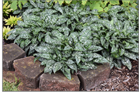
Twinkle Toes Lungwort

Twinkle Toes Lungwort will grow to be about 12 inches tall at maturity, with a spread of 18 inches. When grown in masses or used as a bedding plant, individual plants should be spaced approximately 15 inches apart. Its foliage tends to remain dense right to the ground, not requiring facer plants in front. It grows at a medium rate, and under ideal conditions can be expected to live for approximately 10 years. As an herbaceous perennial, this plant will usually die back to the crown each winter, and will regrow from the base each spring. Be careful not to disturb the crown in late winter when it may not be readily seen!