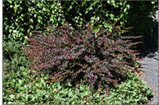
Lava Nugget Barberry

Lava Nugget Barberry is recommended for the following landscape applications;