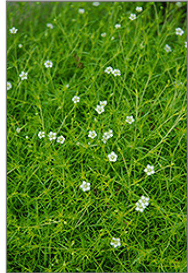
Scotch Moss flowers

Scotch Moss will grow to be only 1 inch tall at maturity, with a spread of 12 inches. Its foliage tends to remain low and dense right to the ground. It grows at a medium rate, and under ideal conditions can be expected to live for approximately 10 years. As an evergreen perennial, this plant will typically keep its form and foliage year-round.