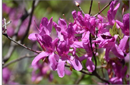
Lilac Lights Azalea flowers