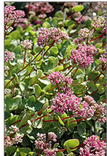
October Daphne flowers