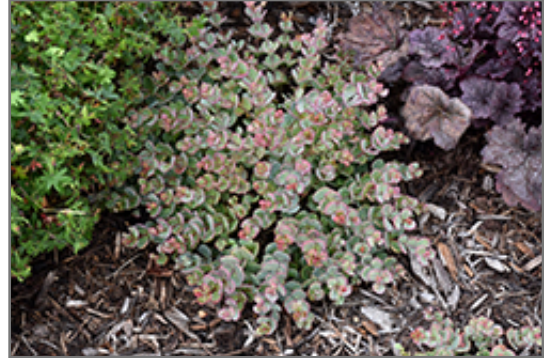
October Daphne