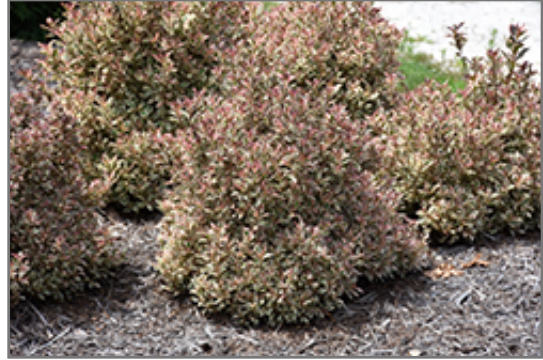
My Monet Weigela

This shrub should only be grown in full sunlight. It prefers to grow in average to moist conditions, and shouldn't be allowed to dry out. It is not particular as to soil type or pH. It is highly tolerant of urban pollution and will even thrive in inner city environments. This is a selected variety of a species not originally from North America.