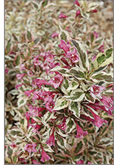
My Monet Weigela flowers