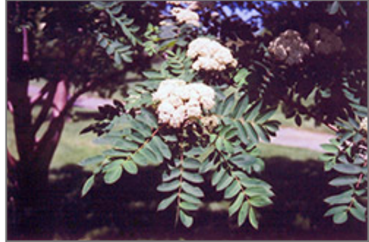
Showy Mountain Ash flowers

This tree should only be grown in full sunlight. It is very adaptable to both dry and moist locations, and should do just fine under average home landscape conditions. It is not particular as to soil type or pH. It is highly tolerant of urban pollution and will even thrive in inner city environments. This species is native to parts of North America.