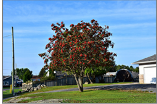
Showy Mountain Ash fruit